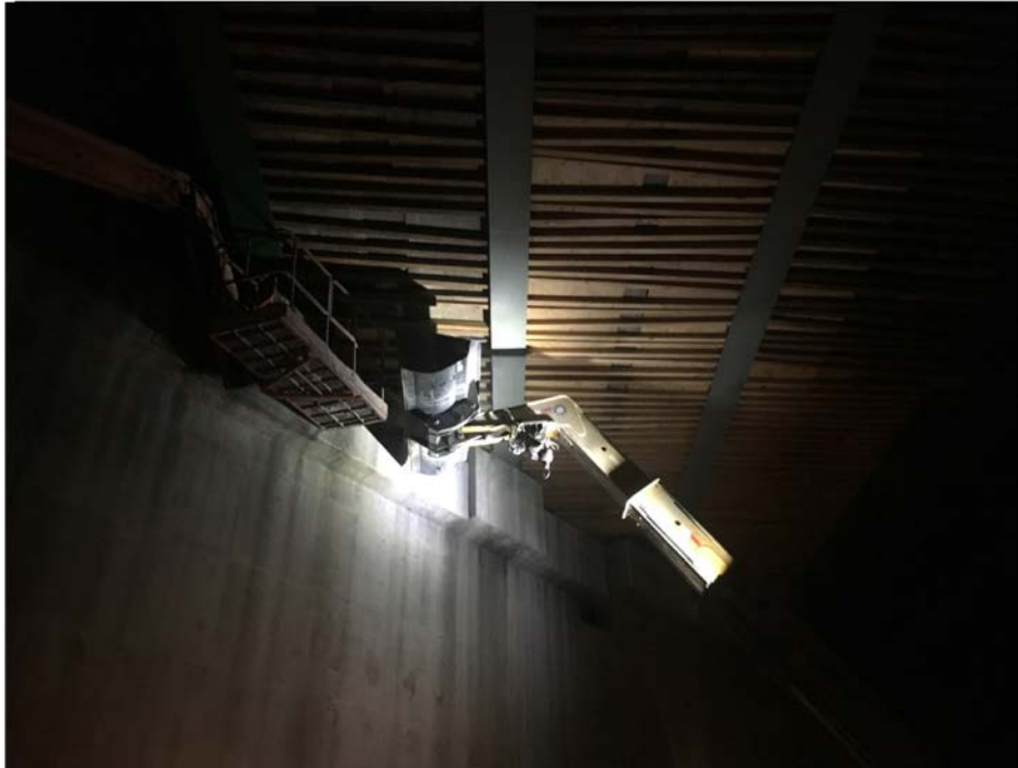
Removing concrete debris

Structure Location & Description of Operation: Providencia OH 53-1085